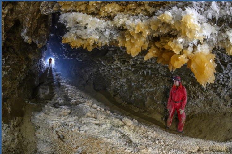
Well-decorated passage in Optimisticeskaya (Ukraine).