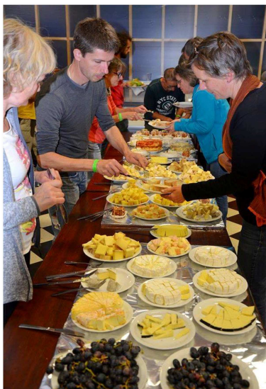
Buffet at the 11 th ESF.

A large number of field trips and presentations, as well as a splendid buffet, contributed to the success of the EuroSpeleo Forum. We thank our Flemish colleagues from the Verbond van Vlaamse Speleologen, our Dutch friends from Speleo Nederland and the Wallonian cavers from the Union Belge de Spéléologie for organising this excellent event!