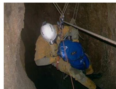
A few impressions of the Banski Suhodol Expedition 2015.