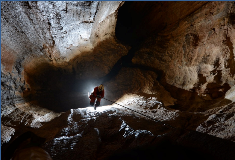
A shaft in Jama Nedam at a depth of -100 m. This photo was taken during the EuroSpeleo Project ESP 2019-06 (Mt. Velebit, Croatia).