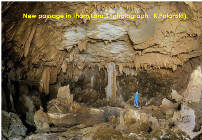
New passage in Tham Lom 3 (photograph: K. Polanski).