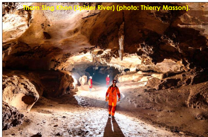
Tham Sing Khon (Spider River).

https://www.thailandcaves.shepton.org.uk/surat-thani-expedition-2020