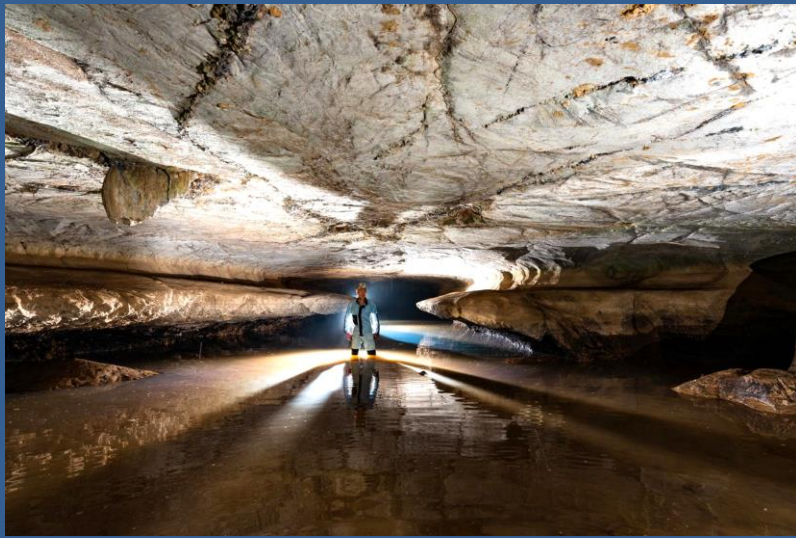
Main river passage in Tham Pla, Wiang Sa district, Surat Thani province (Thailand), International Expedition to Surat Thani 2020.