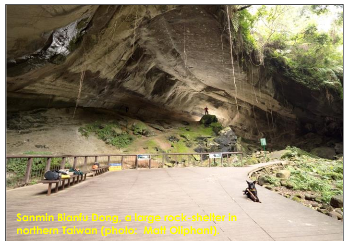
Sanmin Bianfu Dong, a large rock-shelter in northern Taiwan.

The IYCK website is now open at http://www.iyck2021.org/ . It is designed to teach the public about caves and karst, and so it has a great amount of educational information. It also has information on how to become involved in the IYCK. Please send the activities you plan for the IYCK to http://iyck2021.org/index.php/contact-us/ so we can post them on the "Events" page of the website. Have a look at the "Partners" page, and if your organization is not listed, send your logo and website address and you will be included. If you know of organizations that should be involved, please contact them. The website will continue to be updated, so bookmark the URL. The IYCK has incredible potential to advance speleology in many and great ways, but only if we all work together to make it possible.