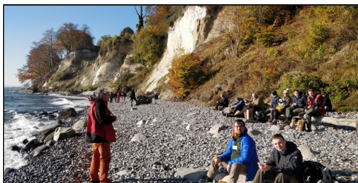
Above: field trip on the island of Rügen. Below: the symposium's lecture room.