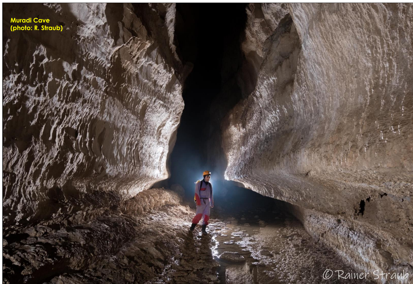
Muradi Cave

The collected samples will be subject of several scientific papers, which will contribute much to the knowledge of Georgian karst-dwelling Mollusca.