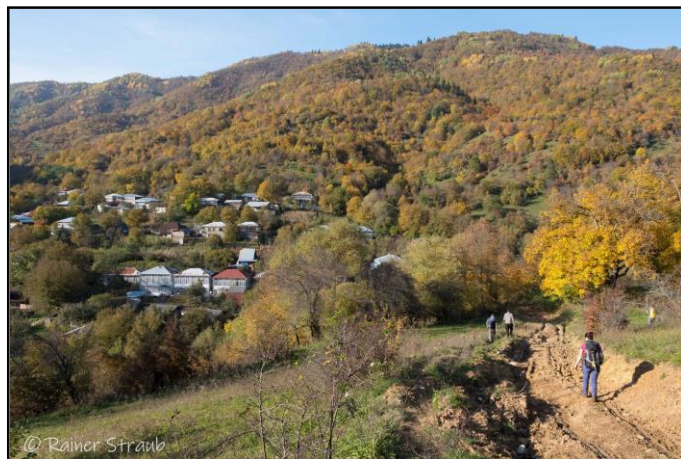
Approach to Kvedi Big Cave in the Racha-Lechkhumi region.

The cave fauna has been investigated in all caves visited and the samples collected were distributed to experts for determination of the taxa.