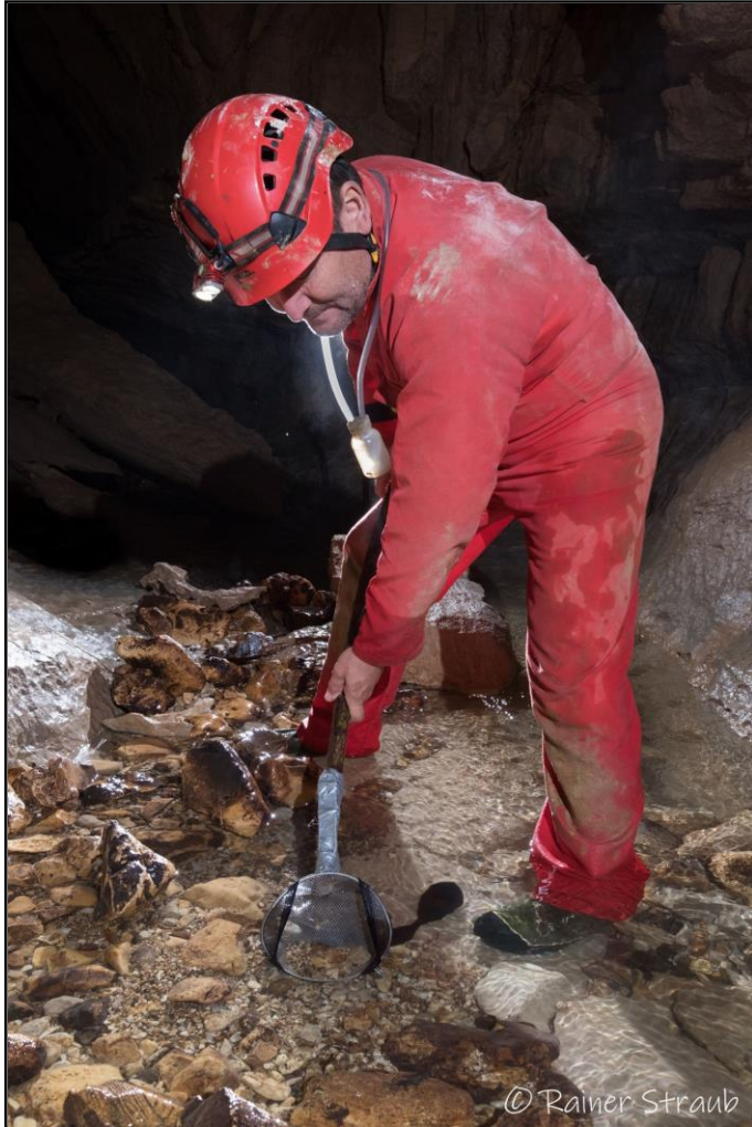
Collection of fauna samples in Georgia.

The expedition was supported by FSE's sponsor Korda's Ropes (Barcelona) as well as a money grant from FSE.