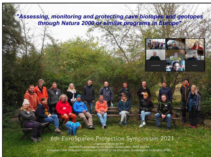
The participants of the 6th EuroSpeleo Protection Symposium.

Technically, it was also the first symposium in a hybrid format, which worked much better than expected.