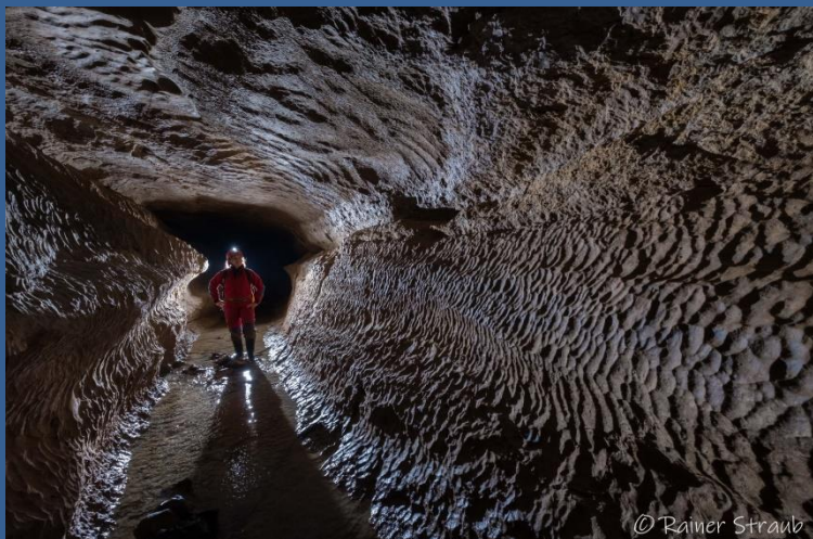
Wet passage with an abundance of scallops in Racha Cave (Georgia) (EuroSpeleo Project ESP 2021-06).