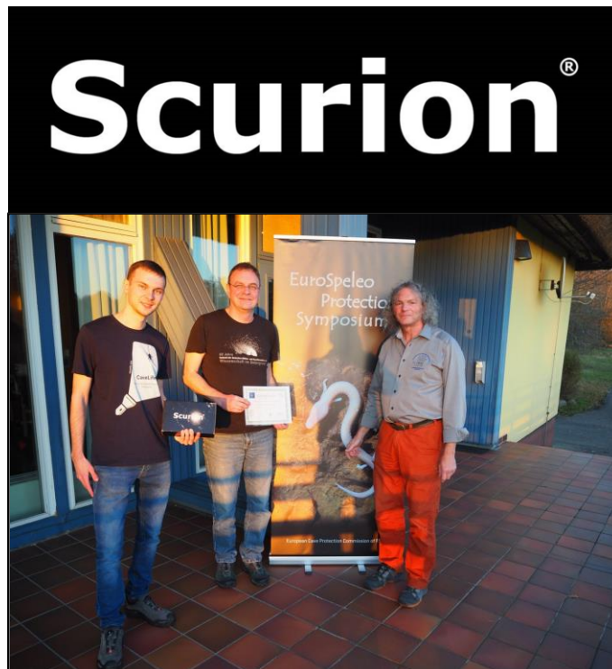
Handover of the 2021 EuroSpeleo Protection Label during the 6th EuroSpeleo Protection Symposium.

recorded on-site. It consists of four pillars: 1. the general data like length, entrance coordinates and cave type, 2. the taxonomic recording of species and species groups, 3. habitat structures and 4. threats. It is possible to evaluate each cave according to the EU Habitats Directive.