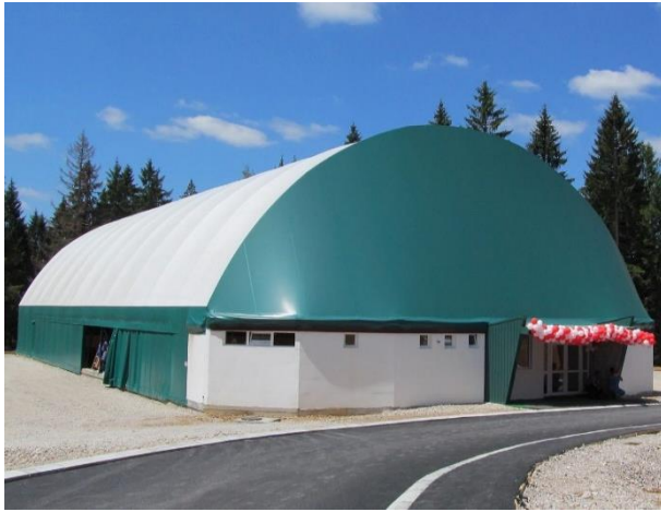
Center of event