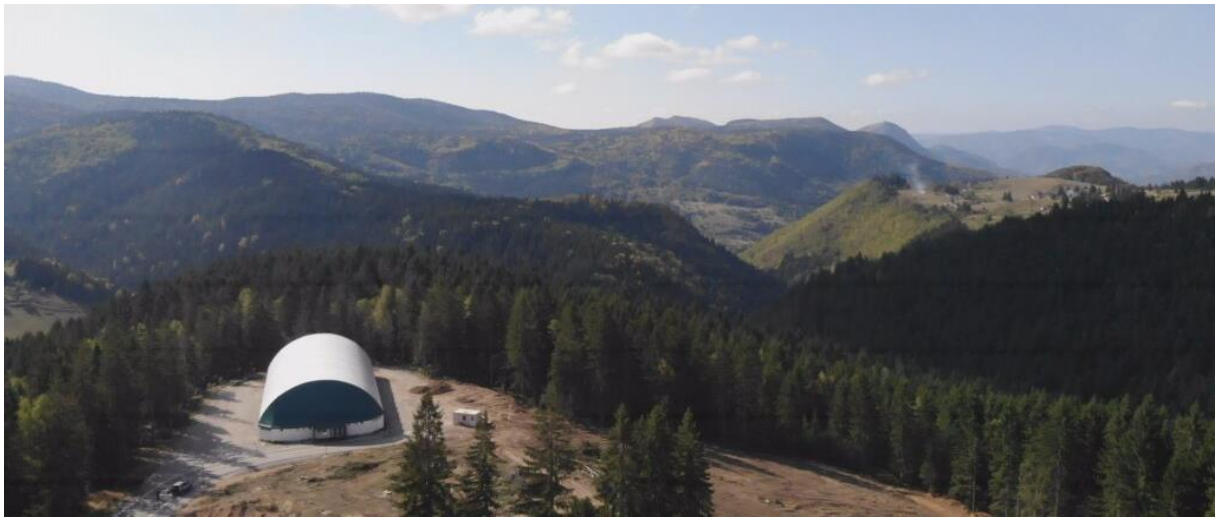
Center of event